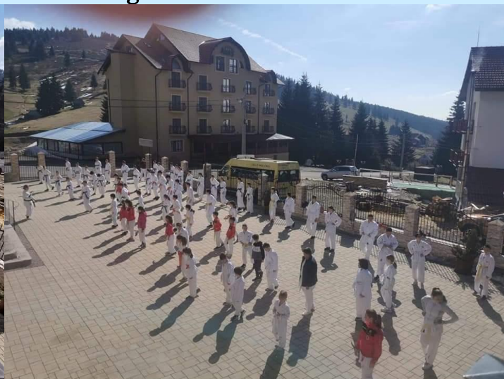
Open air training in village south of the city of Tirgu Jiu.

You must be a daring and ambitious trainer to organize an open-air training with about 90 participants.