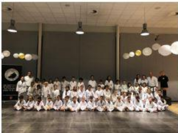
5° Before corona, juniors training