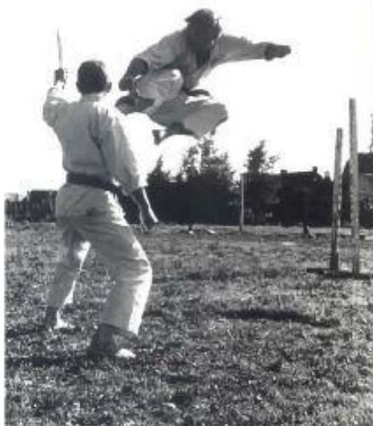
1° Yoko Tobi Geri