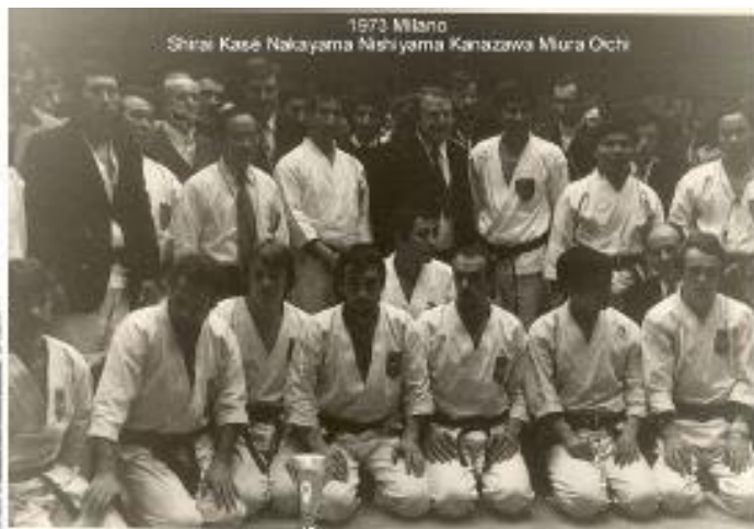
4° European Tournament Milano 1973