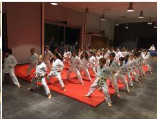
6° With corona, juniors training